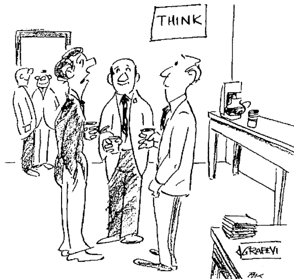
“I'm sober but I'm still broke. Coffee costs as much as booze.”

WE ARE GOING TO KNOW A NEW FREEDOM AND A NEW HAPPINESS Happy Independence Day